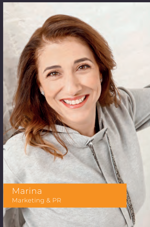
Marina Marketing & PR